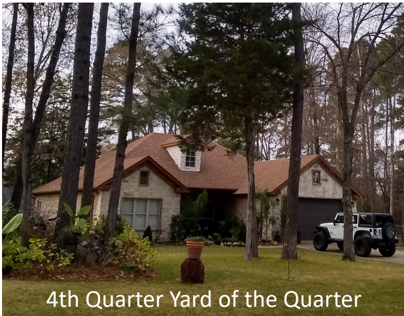
4th Quarter Yard of the Quarter